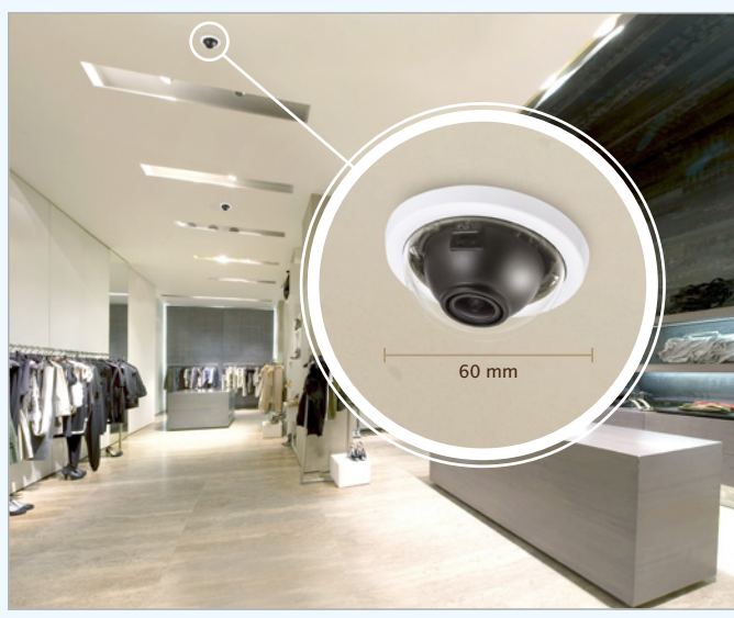
The World's Smallest Recessed Mount Fixed Dome Network Camera