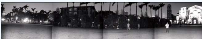
Night View (IR On)