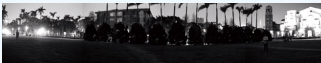
Night View (IR Off)